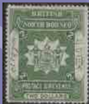
Lot ex 1621 Est £180