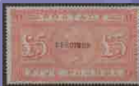
Lot 2570 Est £450