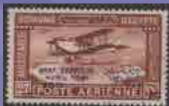
Lot ex 625 Est £60