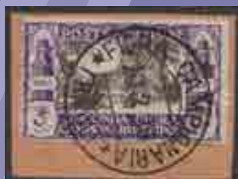
Lot ex 1192 Est £30