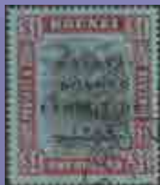
Lot 422 Est £75