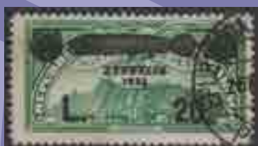
Lot 1900 Est £75