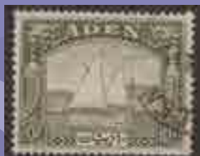
Lot 81 Est £320

Tel: 07938 601513 Email: info@avhstampauctions.co.uk