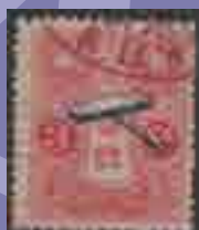
Lot ex 1218 Est £120