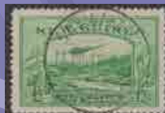
Lot 1791 Est £140