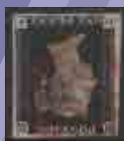
Lot 2408 Est £300