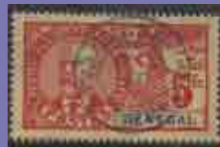
Lot ex 805 Est £50